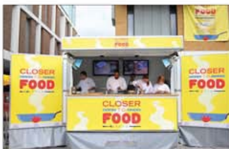
Princesshay Food Festival With Michael Caines, branded for the 'Closer to Food Campaign'