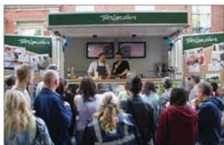
Preston Food Festival Branded for 'Taste Lancashire'