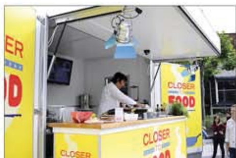
Gunwharf Quays Food Festival With Jean Christophe-Novelli, branded 'Closer to Food'