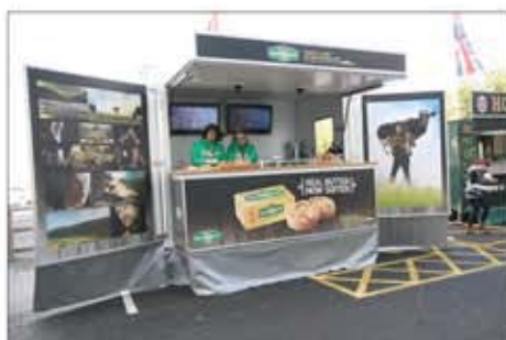
Kerry Gold Promotion Held at Leicester Tigers Stadium