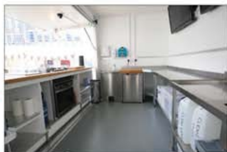
Interior Shot Fully functioning prep & wash up area