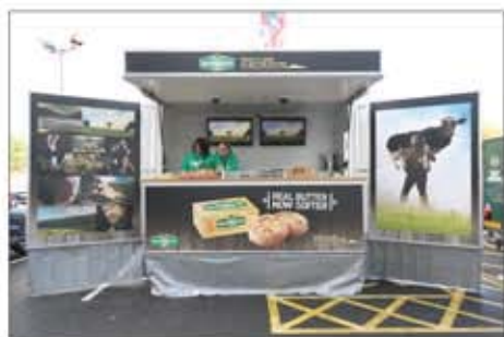
Kerry Gold Promotion Held at Leicester Tigers Stadium