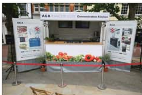
Eat Reading Live AGA Rangemaster branding