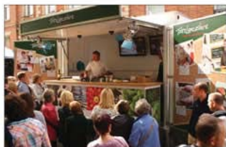
Preston Food Festival Branded for 'Taste Lancashire'