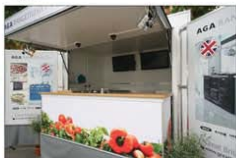
Eat Reading Live AGA Rangemaster branding

AN AFFORDABLE MEDIUM SIZE MOBILE UNIT, COMPLETE WITH PREP & WASH UP AREA. IDEAL FOR OUTDOOR EVENTS.