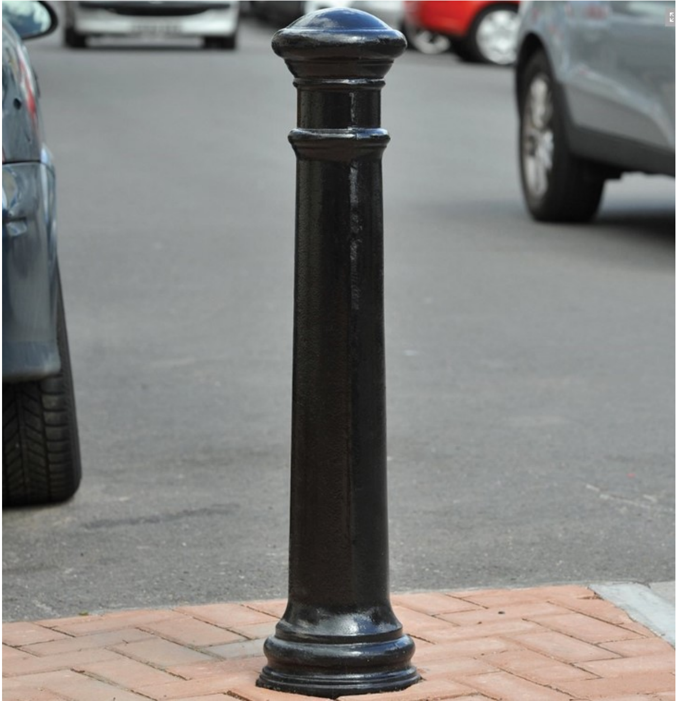
Manchester style heritage bollard