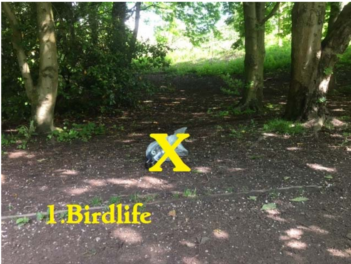
Located by Lever Bridge