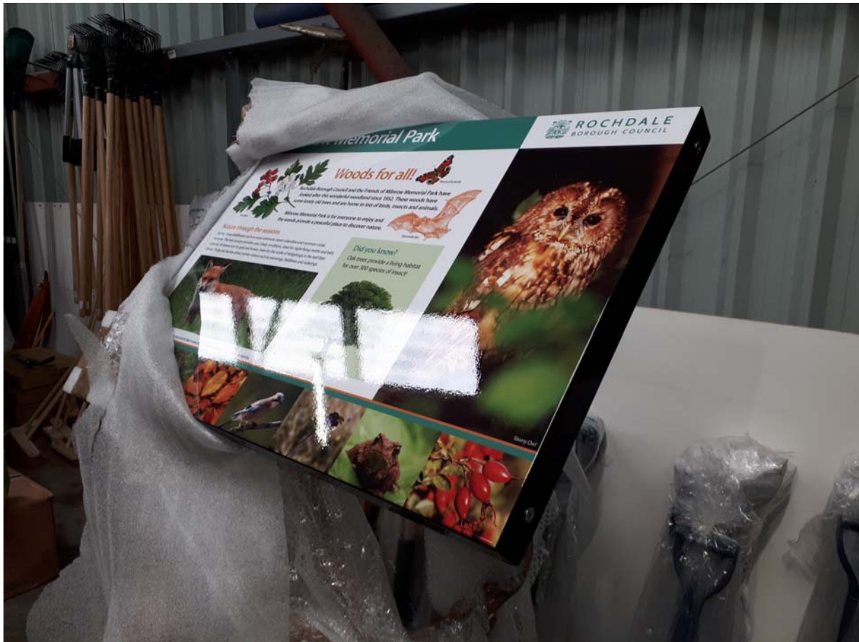
Type of panel to be commissioned and installed