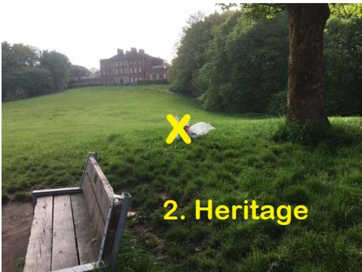
Located near Alkington Hall