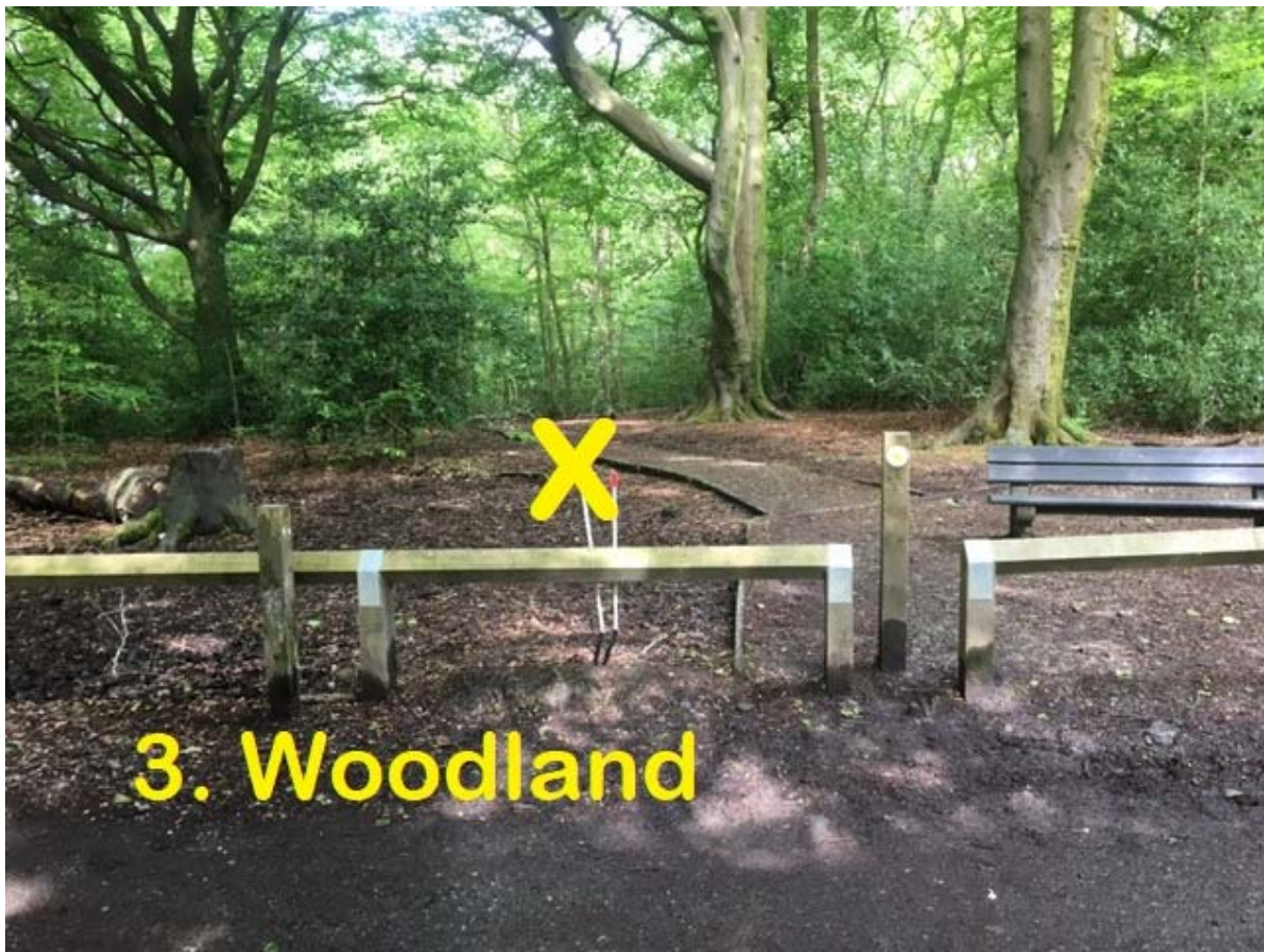
Located in the woodland near Wood Cottage